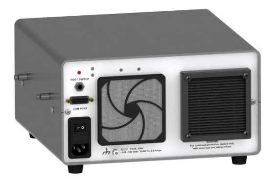
Figure 3. Rear Connections