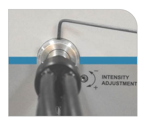
Figure 2. Gently Tighten Setscrew on Lightguide Mount with Hex Wrench