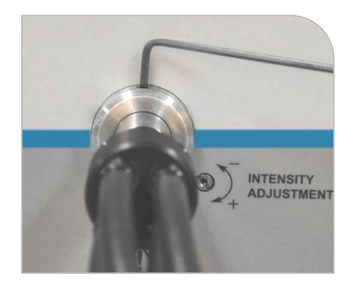
Figure 2. Gently Tighten Setscrew on Lightguide Mount with Hex Wrench