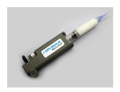
Figure 4. Micro-Dot (Lever) PN T20010