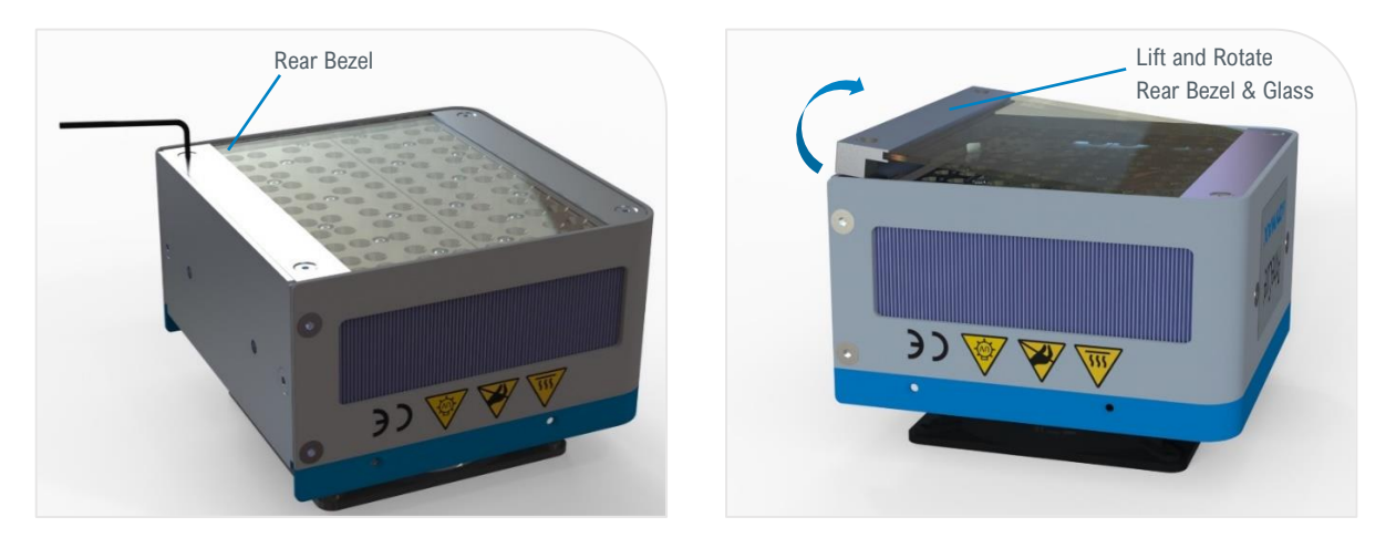
Figure 2. Remove Rear Bezel & Glass