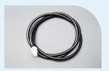
Fluid Line Kit, 3/8" OD Polyethylene