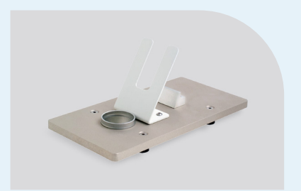
Stand with Drip Cup