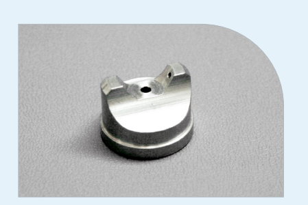
Flat Spray Air Cap