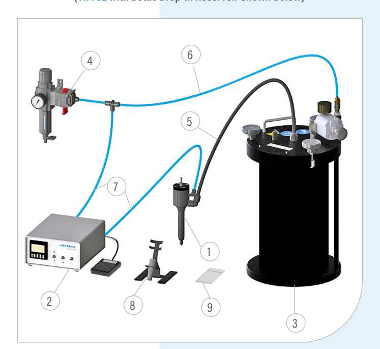
Representative Model 300 Dispensing System (T17701 with Cartridge Reservoir Shown Below)