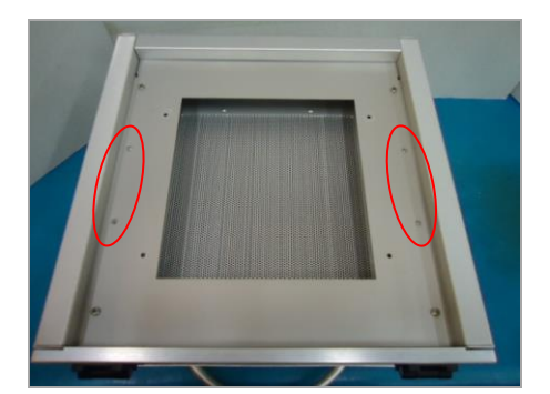
Figure 4. Light Shield Top Plate, Remove Center M4 x 8 mm Screws