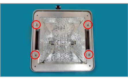
Figure 2. Install Filler Plate