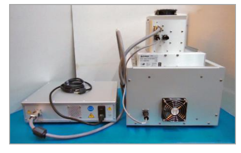
Figure 6. Rear Cable Connections