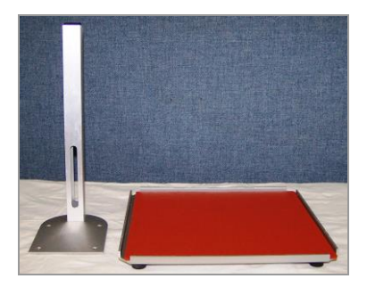
Figure 1. Mounting Stand Kit

Note: The post is offset to the left (Figure 2).