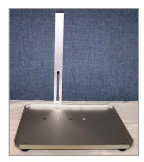
Figure 2. Post Installed on Base

Remove the reflector's filler plate by removing the four screws that hold it in place (Figure 3). Place the glass UV shield on the reflector and reinstall the filler plate with the four screws (Figure 4).