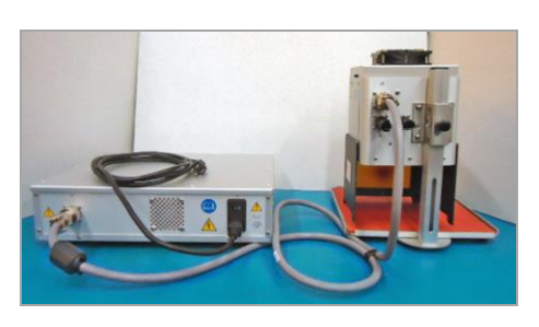
Figure 9. Connect Power Supply to Reflector

For detailed operating instructions, please refer to the ECE Flood Lamp User Guide.