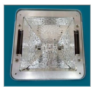
Figure 4. Glass Shield Installed