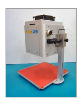
Figure 7. Attach Reflector to Mounting Stand