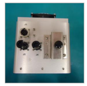
Figure 6. Bypass Connectors Installed