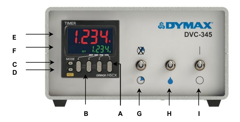
Figure 4. Front Panel

The digital timer on the front of the controller uses up and down arrows to set the required dispense time. The time range is from 0.01 seconds to 9.99 seconds with a settable resolution of .001 seconds.