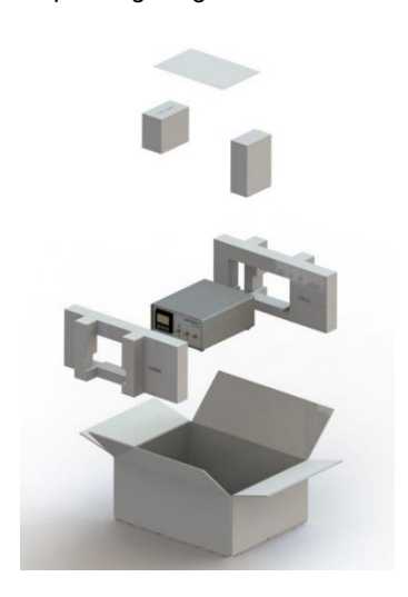
Figure 3. Unpacking Diagram