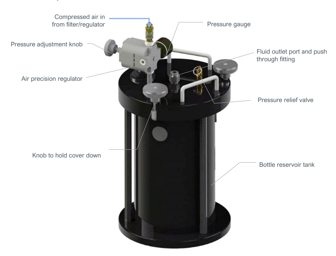
Figure 1. Pressure Tank Components