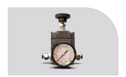
T15454 High-Precision Air Regulator for Fluid Pressure