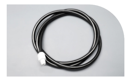
T16787 Fluid Line Kit - 3/8" OD, Polyethylene