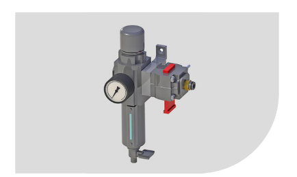
T16307 Air Filter Regulator with Air Shut Off