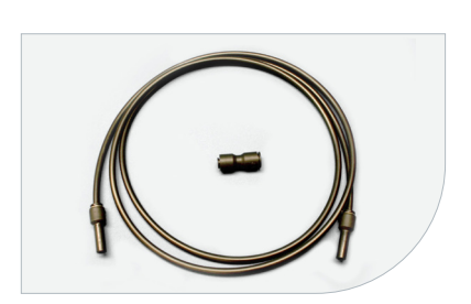
T16793 Fluid Line Kit - 1/4" OD, Polyethylene