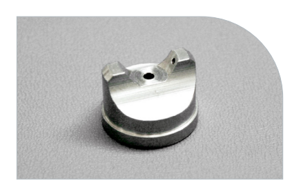
T15697 Flat Spray Air Cap