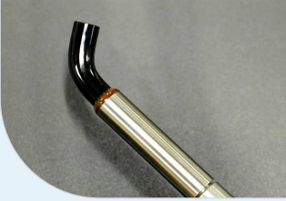
Lightguide End with Collimator Lens