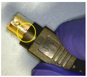
Retracted position for insertion and removal