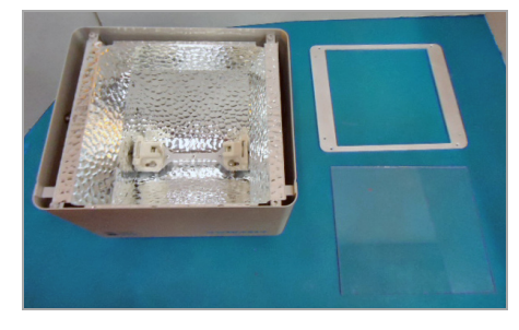
Figure 1. Lamp with Filler Plate Removed