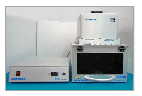
Figure 7. Assembled System

For detailed operating instructions, please refer to the ECE Flood Lamp User Guide.