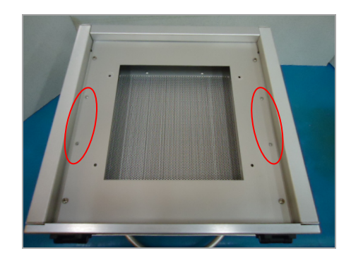
Figure 4. Light Shield Top Plate, Remove Center M4 x 8 mm Screws