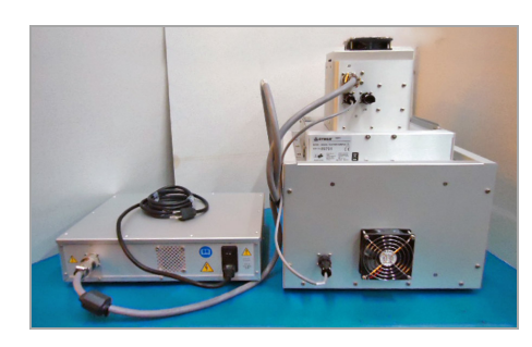
Figure 6. Rear Cable Connections

For detailed operating instructions, please refer to the ECE Flood Lamp User Guide.