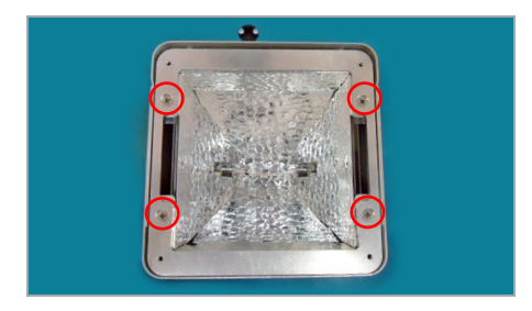
Figure 2. Install Filler Plate