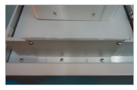
Figure 5. Attach Securing Bracket with M4 x 8 mm screws