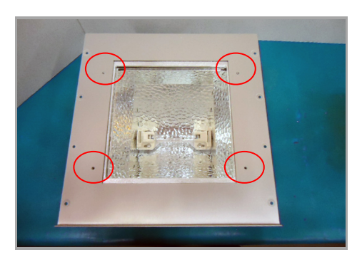
Figure 4. Flood Lamp/Top Cover Assembly

WARNING! With the lamp installed directly to the light shield assembly, the lamp is continuously on when power is applied to the unit. Take appropriate safety precautions when using the equipment in this configuration.