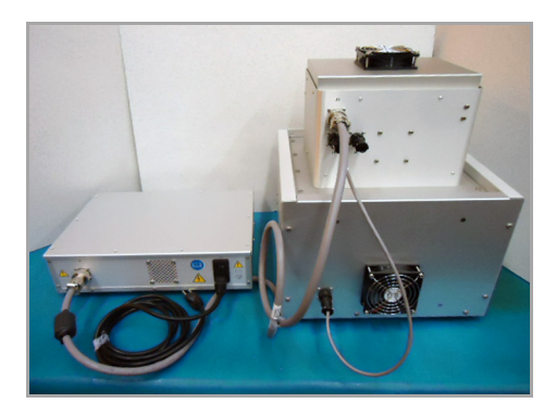
Figure 6. Rear Connections

For detailed operating instructions, please refer to the ECE Flood Lamp User Guide.