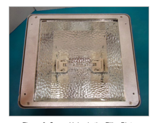
Figure 2. Screw Holes in the Filler Plate