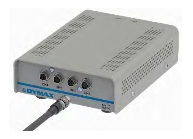
Figure 4. CH 1-4 Jacks