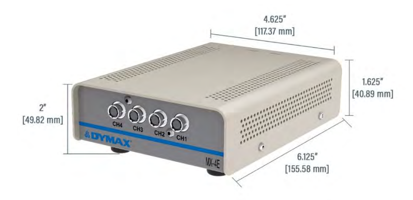
Figure 10. MX-4E Dimensions