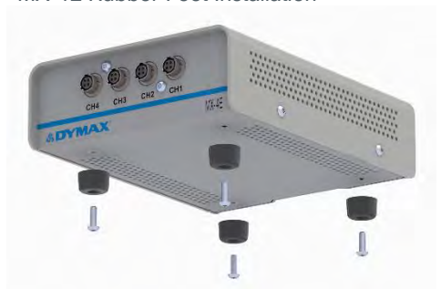
Figure 2. MX-4E Rubber Feet Installation

• To hard mount the unit, remove the rubber feet using a 2-mm hex. The hole thread is an M3 and the depth is 4.8 mm (Figure 2).