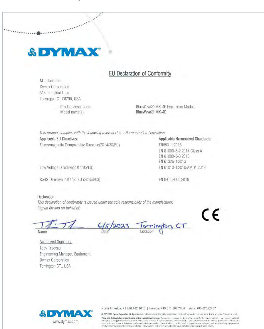
Figure 11. Declaration of Conformity - CE