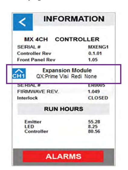
Figure 8. System Information Screen Identifying MX-4E

All controls available to any BlueWave MX-Series emitter may be used, refer to the <u>BlueWave MX-Series Multichannel Controller User Guide (MAN090)</u> for details on operation.