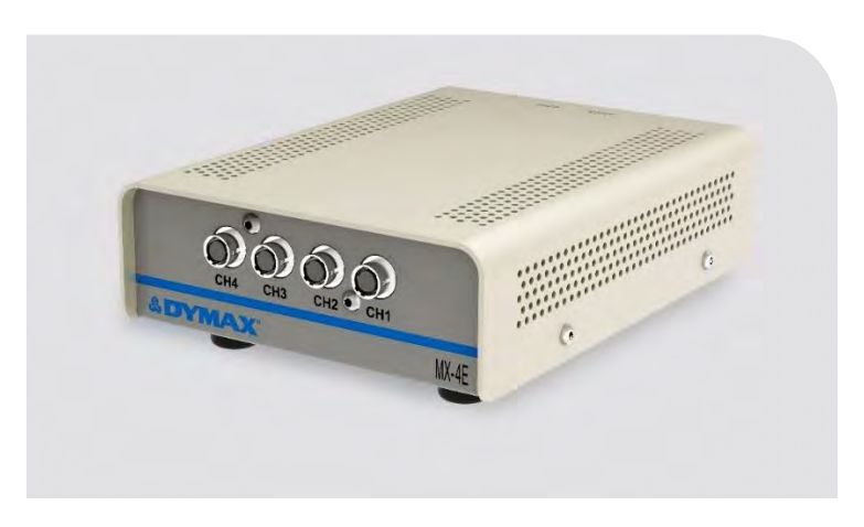
Figure 1. MX-4E Expansion Module for BlueWave® MX-Series Systems