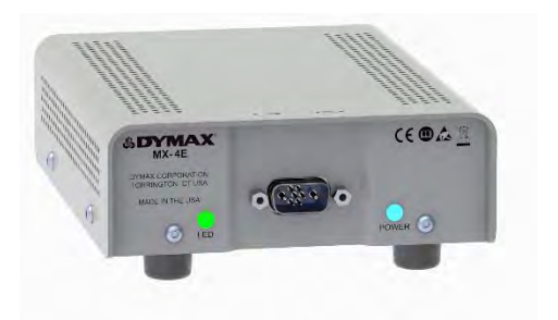
Figure 6. Green and Blue Status LEDs

The green status LED on the back of the unit indicates the emitter is commanded to be on. The blue status LED on the back of the unit indicates there is power applied to the MX-4E. (Figure 6)