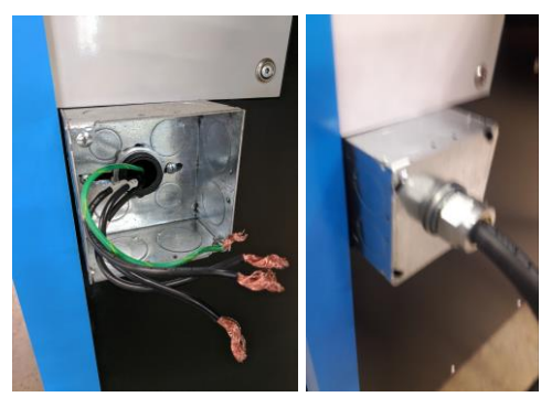
Figure 4. Two Wiring Options