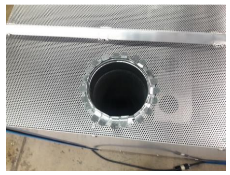
Figure 2. Blower Exhaust Vent Connection