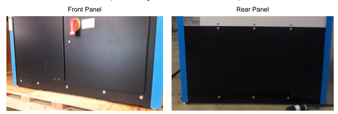
Figure 1. Front and Rear Panels - Remove for Forklift Access