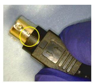
Position of plastic when housing is not retracted