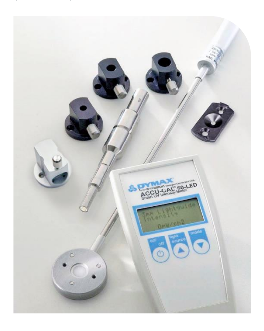
Parts List - Spot & Line Array Configuration