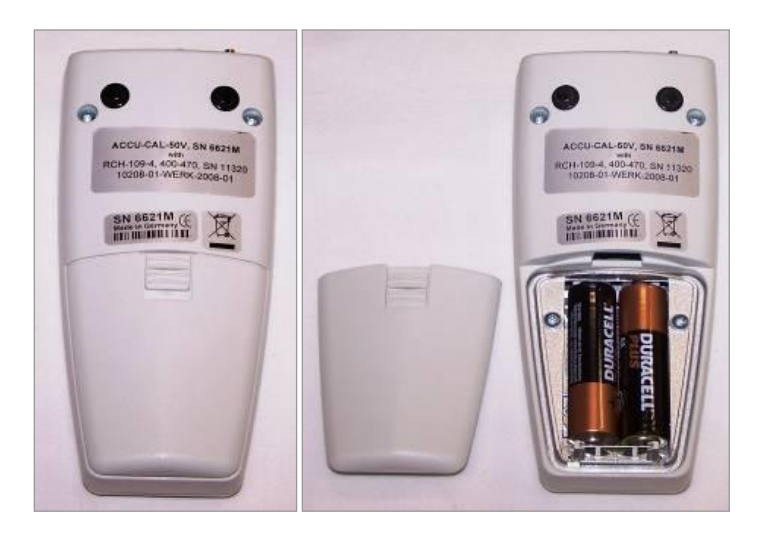
Figure 19. Battery Compartment (Closed & Open)

• Keep the detector head's sensing element clean and free of contaminants. The detector head may be cleaned with a clean tissue wetted with isopropyl alcohol.