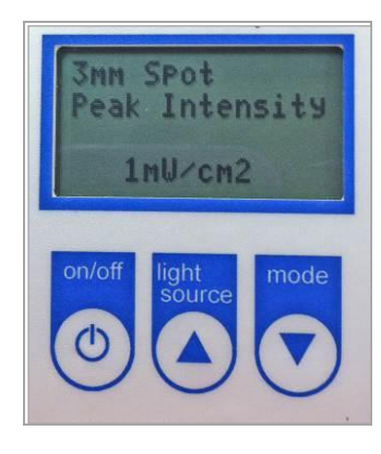
Figure 18. Spot Mode Screens (Shown in Peak Intensity Mode)