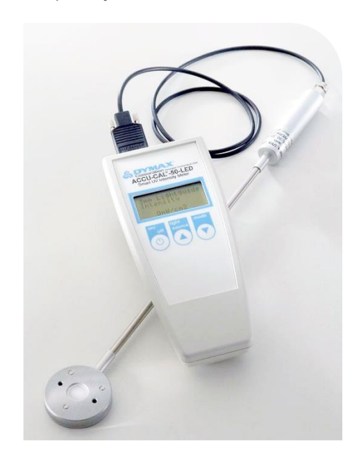
Parts List - Flood Configuration