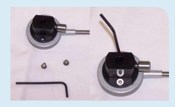
Figure 8. Attach Lightguide Adapter to Lightguide (Step 4)