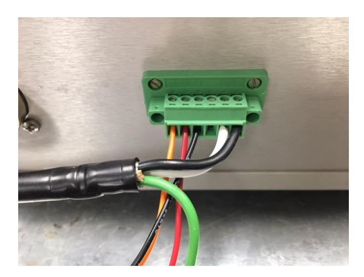
Figure 4. Connection on the 6-Pin Connector