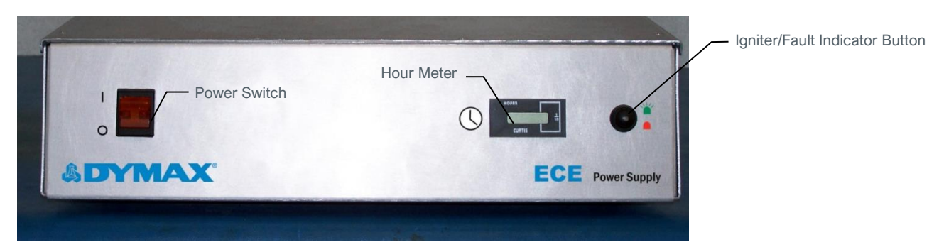
Figure 5. Power Supply Front Panel

After the lamp has ignited, allow five minutes for the lamp to reach its maximum output intensity.