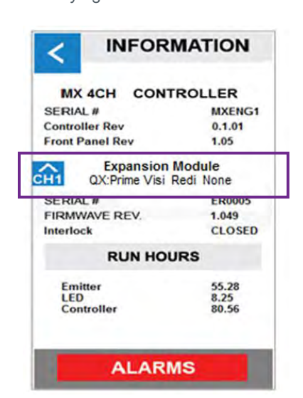
Figure 8. System Information Screen Identifying MX-4E

All controls available to any BlueWave MX-Series emitter may be used, refer to the <u>BlueWave MX-Series Multichannel Controller User Guide (MAN090)</u> for details on operation.