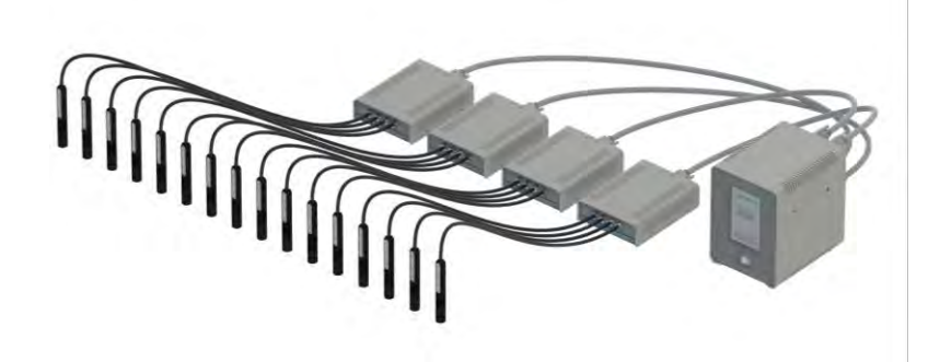
Figure 3. Example of Installation, BlueWave MX-Series 4-Channel Controller with 16 Heads