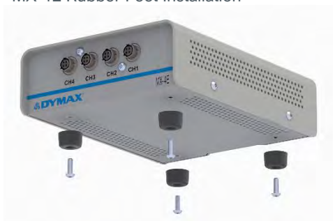
Figure 2. MX-4E Rubber Feet Installation

• To hard mount the unit, remove the rubber feet using a 2-mm hex. The hole thread is an M3 and the depth is 4.8 mm (Figure 2).