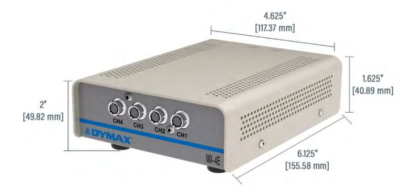
Figure 10. MX-4E Dimensions