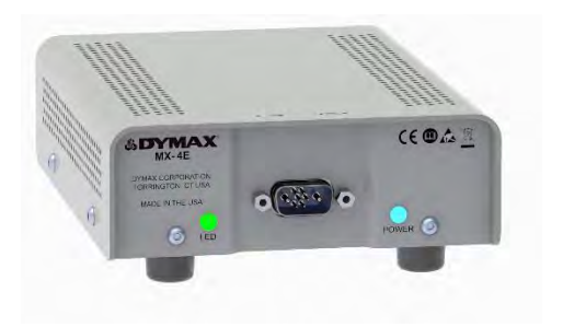
Figure 6. Green and Blue Status LEDs

The green status LED on the back of the unit indicates the emitter is commanded to be on. The blue status LED on the back of the unit indicates there is power applied to the MX-4E. (Figure 6)