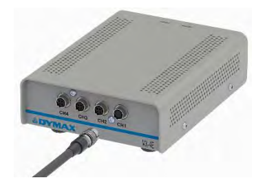
Figure 4. CH 1-4 Jacks