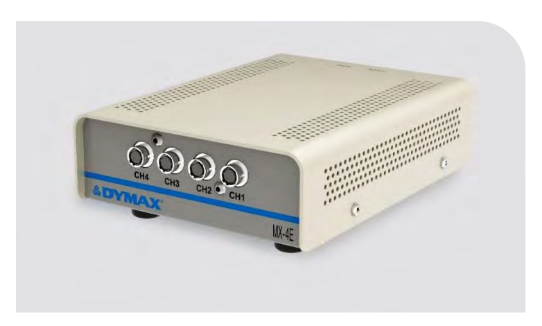
Figure 1. MX-4E Expansion Module for BlueWave® MX-Series Systems