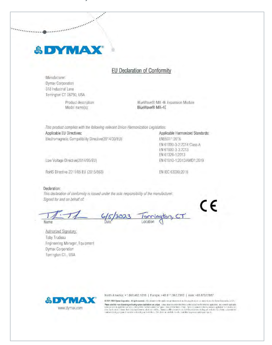
Figure 11. Declaration of Conformity - CE