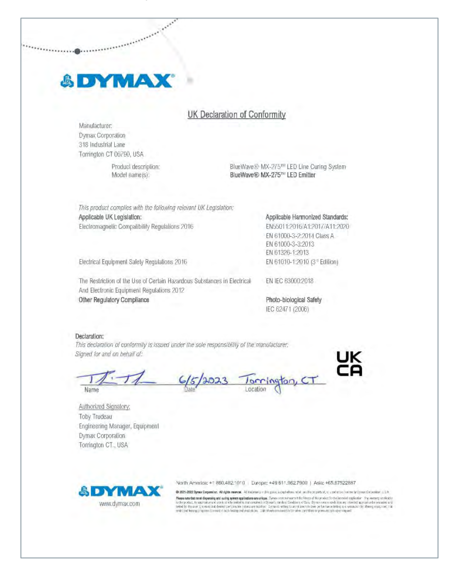
Figure 7. Declaration of Conformity - UKCA