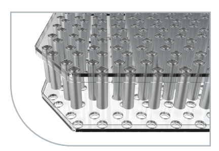
C. Fixturing the Battery Cell to the Base on the Battery Pack