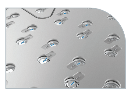
B. Solder Joint Protection on the Battery Pack